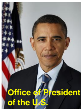
Office of President of the U.S.