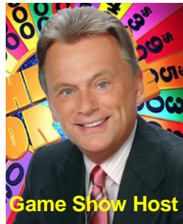
Game Show Host